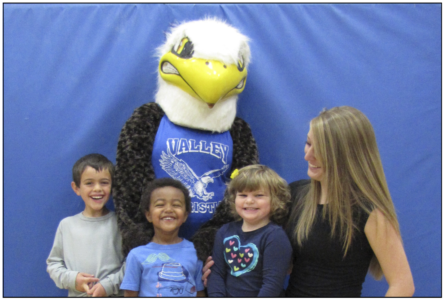
"E" is for the Eagle that recently soared into our preschool PE class.