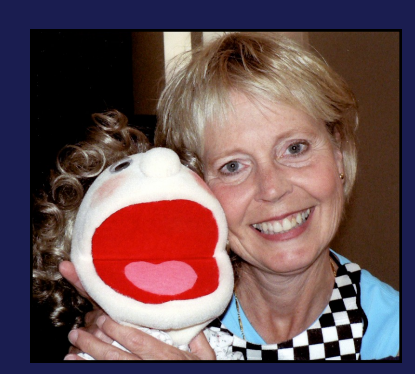
Ministering with puppets is one of the many ways to teach God's Word in Germany.