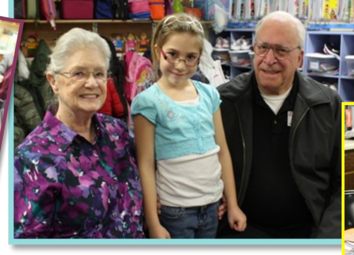
On November 20th, grandparents were specially invited to take part in the learning process at VCS.

Love is a vital part of the learning environment for all generations.